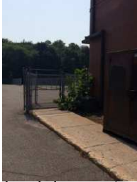
school door entry.

Morning student entry and after school dismissal is at the school gate (facing Forest Street). Parents can walk their children to the gate in the morning. After school the children will be dismissed from this gate and parents can meet their children here. Parents are not permitted in the schoolyard. Parents having school business, are to access the school through the main entrance. Between 8:00 to 8:10 there is a teacher supervising this area and there is a teacher supervising the